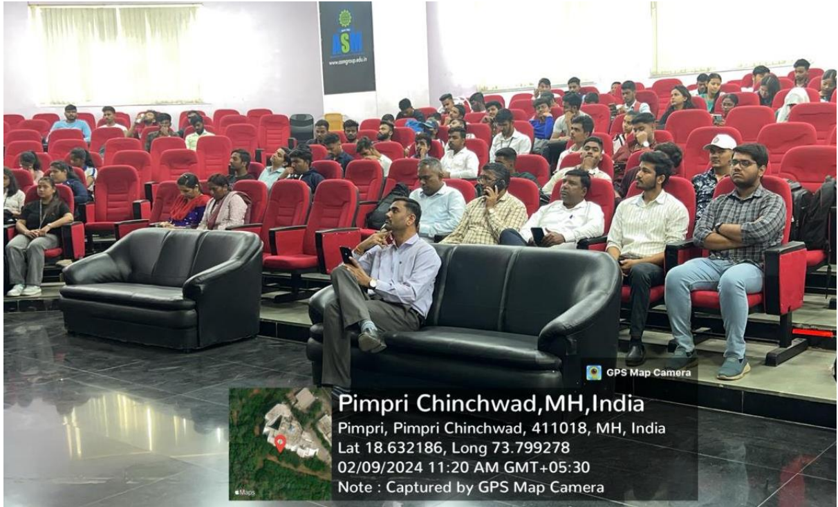
Pimpri Chinchwad, MH, India Pimpri, Pimpri Chinchwad, 411018, MH, India Lat 18.632186, Long 73.799278 02/09/2024 11:20 AM GMT+05:30 Note : Captured by GPS Map Camera