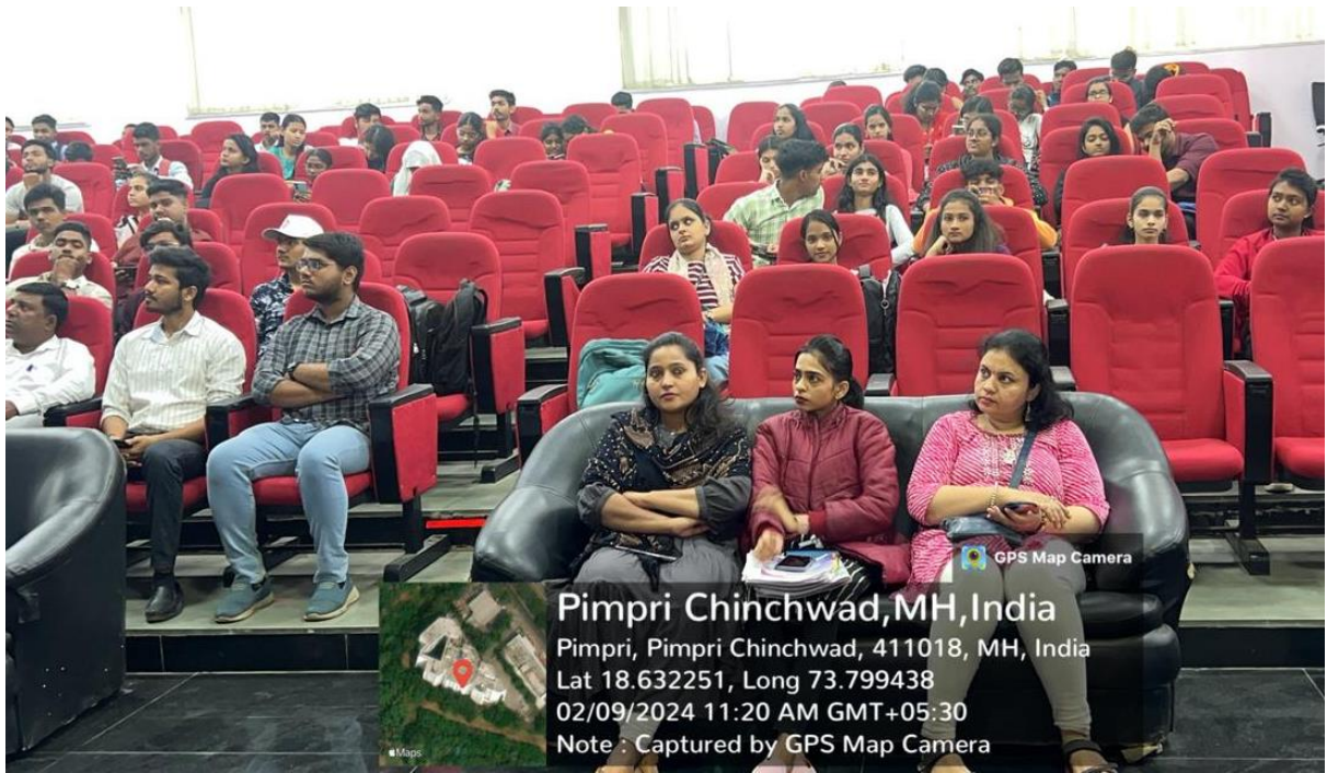
Pimpri Chinchwad, MH, India Pimpri, Pimpri Chinchwad, 411018, MH, India Lat 18.632251, Long 73.799438 02/09/2024 11:20 AM GMT+05:30 Note : Captured by GPS Map Camera