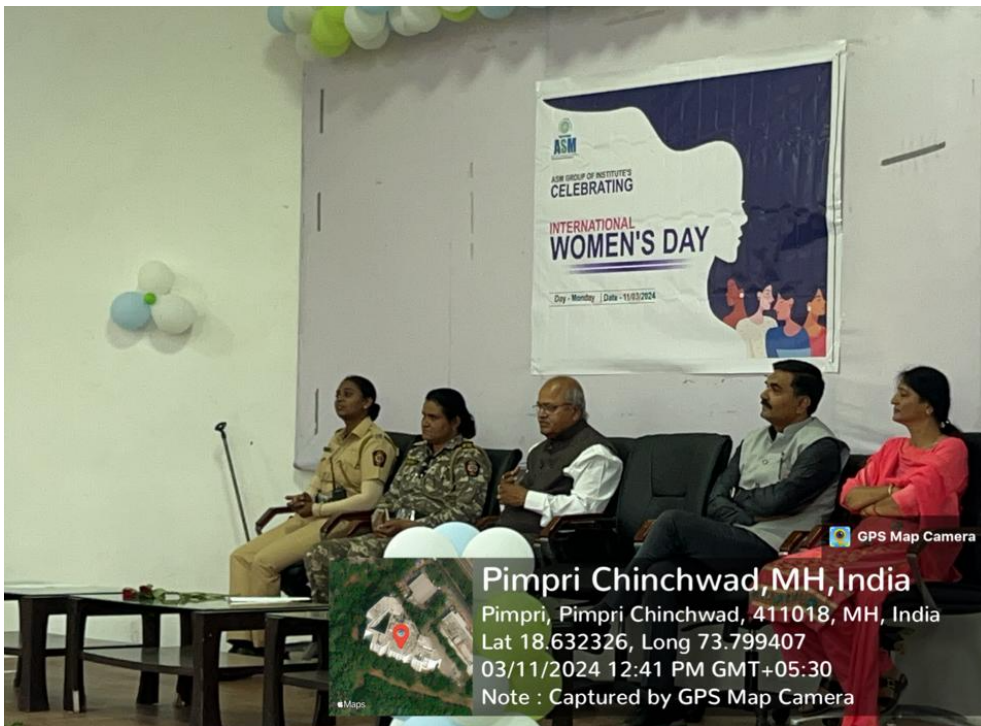
Pimpri Chinchwad, MH, India Pimpri, Pimpri Chinchwad, 411018, MH, India Lat 18.632326, Long 73.799407 03/11/2024 12:41 PM GMT+05:30 Note : Captured by GPS Map Camera