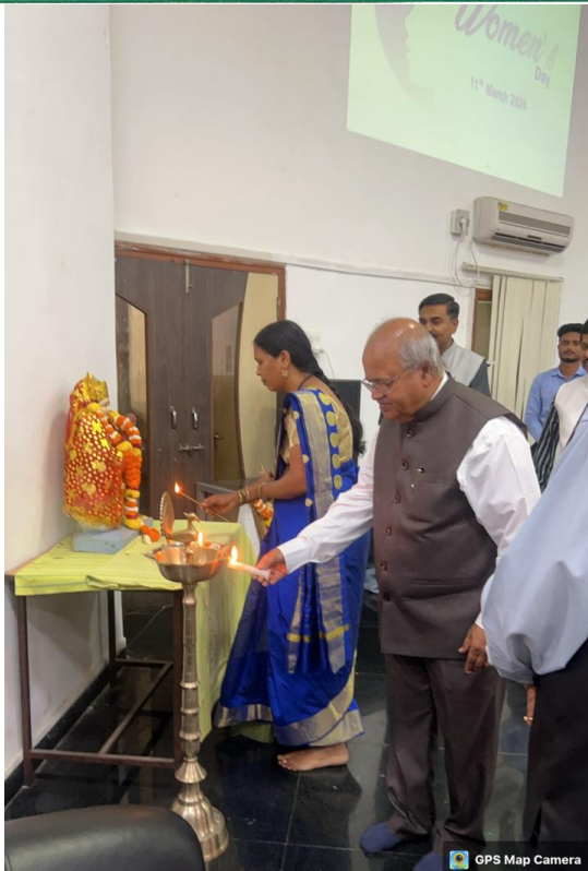
Pimpri Chinchwad, MH, India Pimpri, Pimpri Chinchwad, 411018, MH, India Lat 18.632287, Long 73.799463 03/11/2024 12:21 PM GMT+05:30 Note : Captured by GPS Map Camera