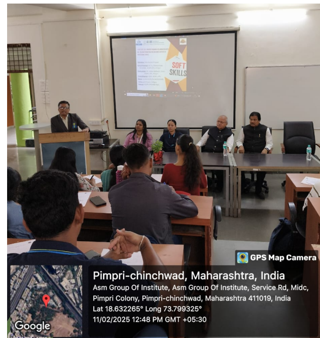
GPS Map Camera Pimpri-chinchwad, Maharashtra, India Asm Group Of Institute, Asm Group Of Institute, Service Rd, Midc, Pimpri Colony, Pimpri-chinchwad, Maharashtra 411019, India Lat 18.632265° Long 73.799325° 11/02/2025 12:48 PM GMT +05:30