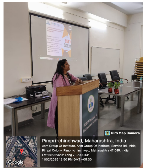
GPS Map Camera Pimpri-chinchwad, Maharashtra, India Asm Group Of Institute, Asm Group Of Institute, Service Rd, Midc, Pimpri Colony, Pimpri-chinchwad, Maharashtra 411019, India Lat 18.632329° Long 73.798313° 11/02/2025 12:50 PM GMT +05:30