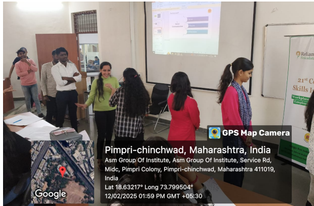
Pimpri-chinchwad, Maharashtra, India Asm Group Of Institute, Asm Group Of Institute, Service Rd, Midc, Pimpri Colony, Pimpri-chinchwad, Maharashtra 411019, India Lat 18.63217° Long 73.799504° 12/02/2025 01:59 PM GMT +05:30