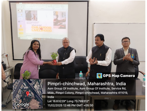
GPS Map Camera Pimpri-chinchwad, Maharashtra, India Asm Group Of Institute, Asm Group Of Institute, Service Rd, Midc, Pimpri Colony, Pimpri-chinchwad, Maharashtra 411019, India Lat 18.632229° Long 73.799312° 11/02/2025 12:46 PM GMT +05:30