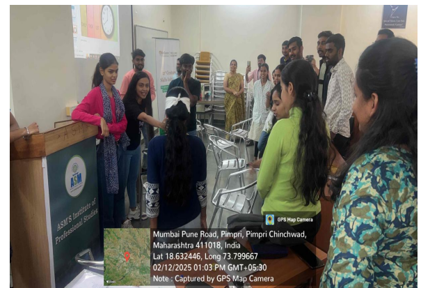
GPS Map Camera Mumbai Pune Road, Pimpri, Pimpri Chinchwad, Maharashtra 411018, India Lat 18.632446, Long 73.799667 02/12/2025 01:03 PM GMT +05:30 Note - Captured by GPS Map Camera