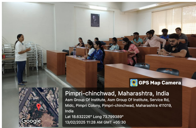
GPS Map Camera Pimpri-chinchwad, Maharashtra, India Asm Group Of Institute, Asm Group Of Institute, Service Rd, Midc, Pimpri Colony, Pimpri-chinchwad, Maharashtra 411019, India Lat 18.632226° Long 73.799389° 13/02/2025 11:28 AM GMT +05:30