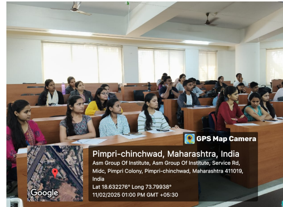
Pimpri-chinchwad, Maharashtra, India Asm Group Of Institute, Asm Group Of Institute, Service Rd, Midc, Pimpri Colony, Pimpri-chinchwad, Maharashtra 411019, India Lat 18.632276° Long 73.79938° 11/02/2025 01:00 PM GMT +05:30