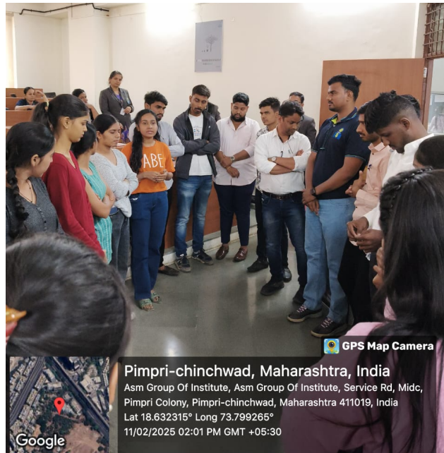
Pimpri-chinchwad, Maharashtra, India Asm Group Of Institute, Asm Group Of Institute, Service Rd, Midc, Pimpri Colony, Pimpri-chinchwad, Maharashtra 411019, India Lat 18.632315° Long 73.799265° 11/02/2025 02:01 PM GMT +05:30