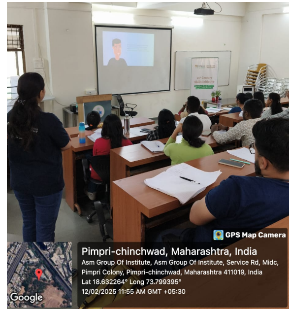
Pimpri-chinchwad, Maharashtra, India Asm Group Of Institute, Asm Group Of Institute, Service Rd, Midc, Pimpri Colony, Pimpri-chinchwad, Maharashtra 411019, India Lat 18.632264° Long 73.799395° 12/02/2025 11:55 AM GMT +05:30