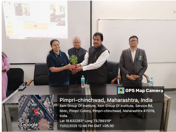
GPS Map Camera Pimpri-chinchwad, Maharashtra, India Asm Group Of Institute, Asm Group Of Institute, Service Rd, Midc, Pimpri Colony, Pimpri-chinchwad, Maharashtra 411019, India Lat 18.632283° Long 73.799319° 11/02/2025 12:46 PM GMT +05:30