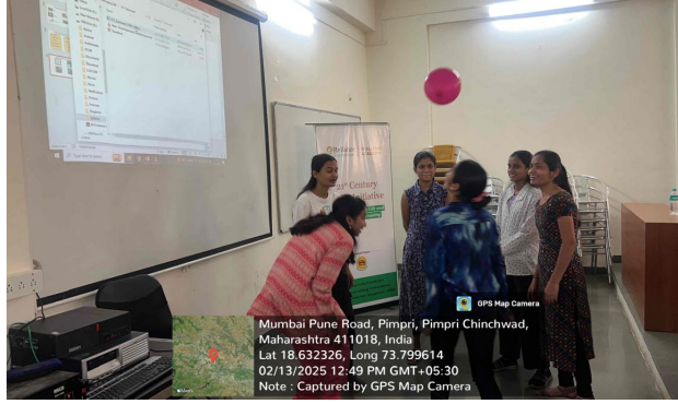
Mumbai Pune Road, Pimpri, Pimpri Chinchwad, Maharashtra 411018, India Lat 18.632326, Long 73.799614 02/13/2025 12:49 PM GMT+05:30