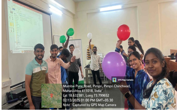
Mumbai Pune Road, Pimpri, Pimpri Chinchwad, Maharashtra 411018, India Lat 18.632381, Long 73.799652 02/13/2025 01:00 PM GMT-05:30 Note: Captured by GPS Map Camera